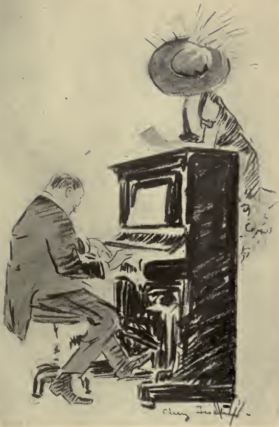
SHE IS STARRING IN OPERA IN AMERICA THIS YEAR.